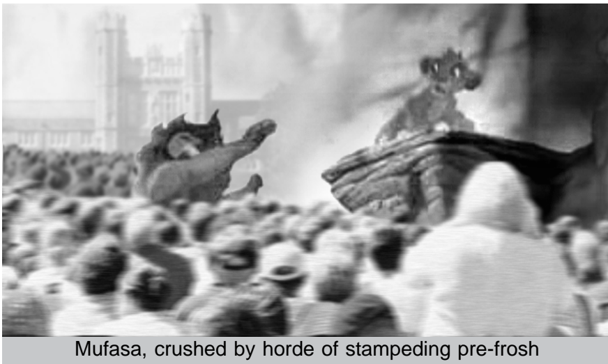
Mufasa, crushed by horde of stampeding pre-frosh

Sorrow filled the animal kingdom yesterday as Mufasa, famed King of the Pridelands, died heroically in an attempt to save his only son from a stampede of spooked pre-freshmen. Since Mufasa's death, Simba's whereabouts are unknown; many believe that he too died in the stampede, although his body has yet to be found. Mufasa's death and Simba's disappearance have left the Pridelands, which stretch from Mudd field to the murky depths of