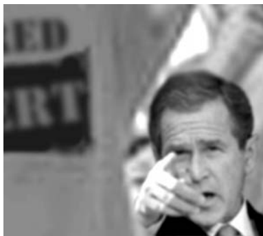
Bush pursuing a potential terrorist threat

continued from page 1 impunity inside our borders,” said president Bush, speaking from a make-shift bunker under Mallinckrodt. “That’s why I took every precaution to make sure that the campus was safe and secure, so that we can move forward with peace and freedom.”