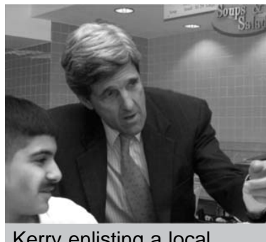
Kerry enlisting a local student to aid in his lunch-selection process

continued from page 1 has more fat, chicken or beef? Will the pasta stain his teeth? If he gets onions, will he have to take a shot of banana? He hates banana. He’s running for President here, he can’t rush this sort of decision.”