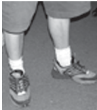
Chandler Miller Undecided

"Sure, WUPD is never around when you want them, but whenever my friends and I try to do an eight-story beer bong off of Brookings Castle, they can't arrest us fast enough."