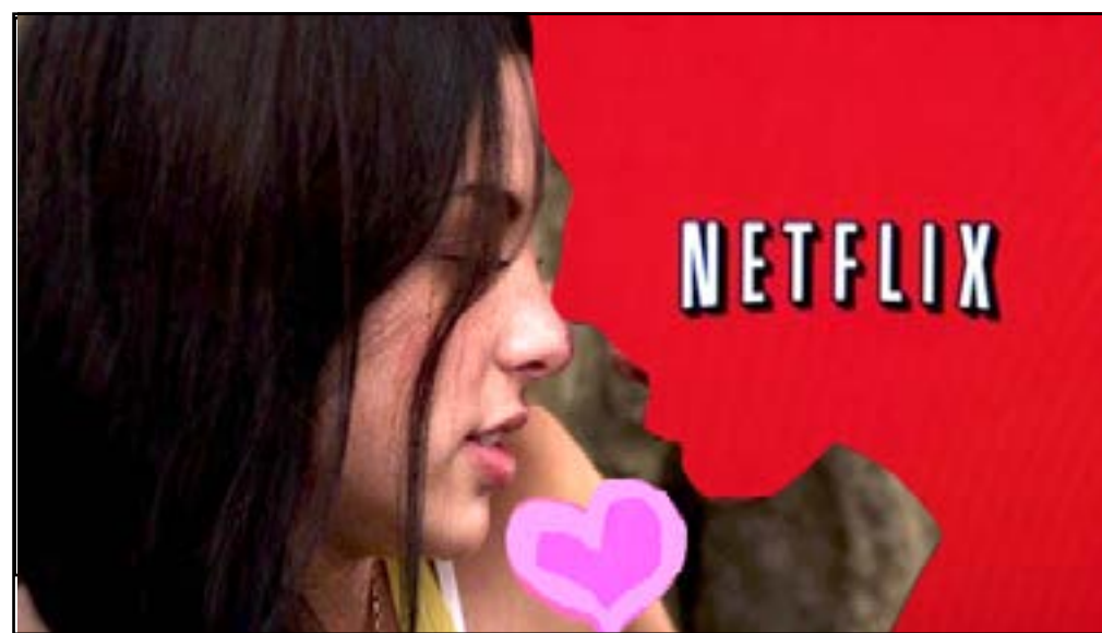
Sure he's a babe. But is he right for her?