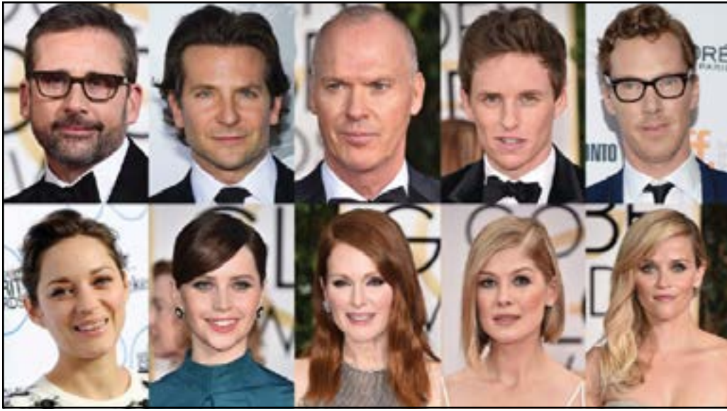
Notice anything missing?

That shit was the best movie of the whole goddamn year! First off, Legos are awesome. 'Nuff said. Will Ferrell was amazing