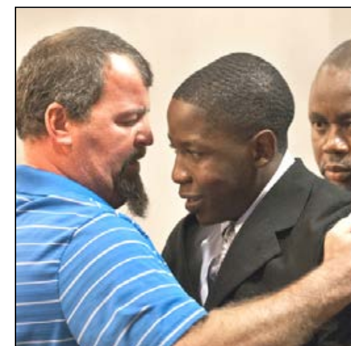
Dramatic recreation of the offending hug