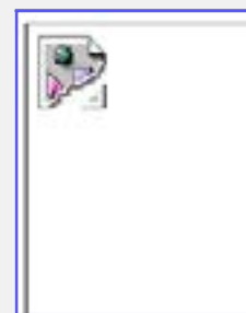
The Prophet Muhammad

"Oh-hoh-hoh ma petite chérie, sacré bleu! L'omelette du fromage, voulez-vous coucher avec moi ce soir."