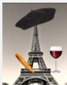
La Tour Eiffel

"Wait, what are Muslims and should I hate them more or less than Jews?"