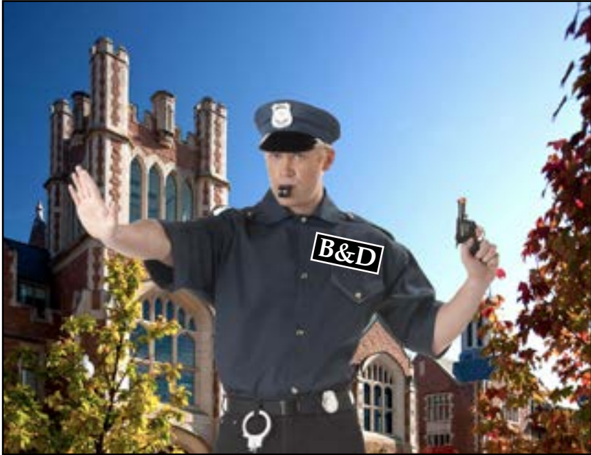
Wash U's finest

In recent years, sexual assault cases, especially those which happen on college campuses, have gained more exposure in the national media. In order to address these concerns, Washington University has increased campus event security staff, B&D, to protect of Wash U students who might commit these crimes.