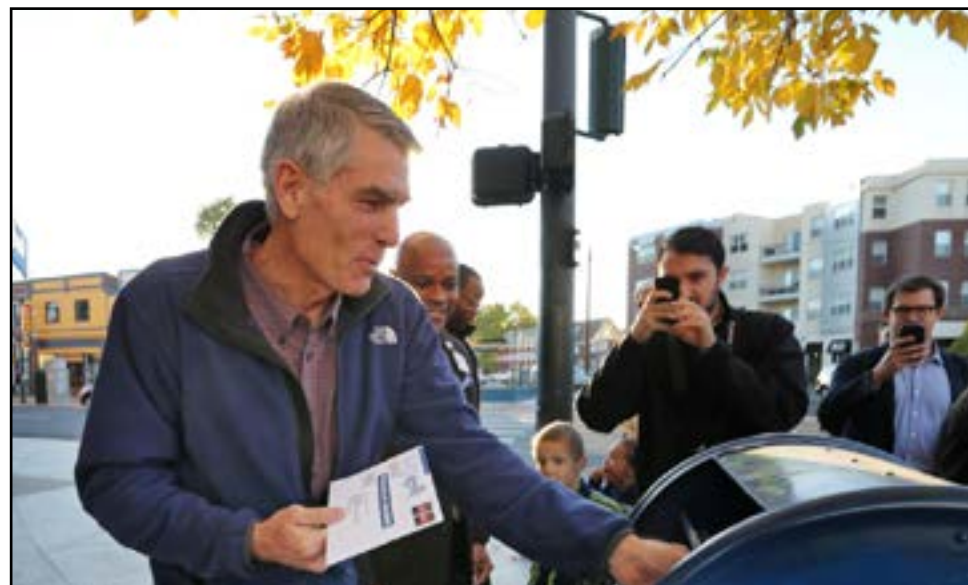
Mark Udall sending an untimely letter to his ex-voters

Following this month's midterm elections, Senator Mark Udall (D-CO) is having a hard time taking a hint that Colorado voters want to move on. Losing by nearly 3% to Republican Cory Gardner, Udall, just doesn't seem to get it in his current "lame-duck" session.