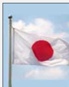
The Nation-State of Japan