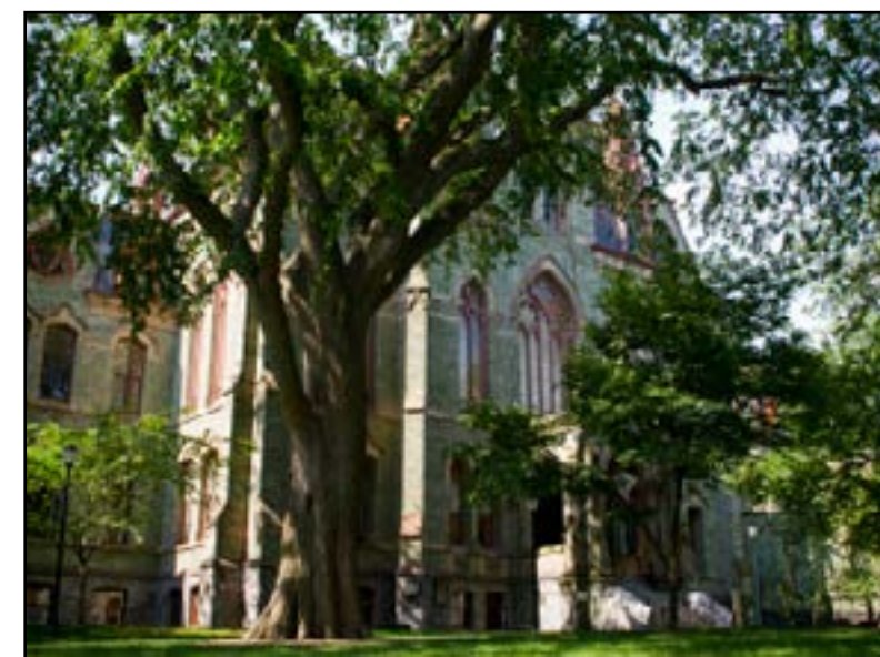
Ooo, so close!